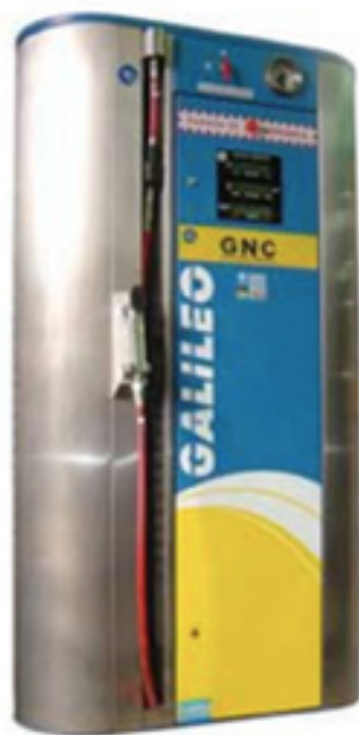
Dispenser Line with state of the art technology